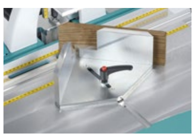
Angle fence-/Right angle fence 45° elevation (W3017000)