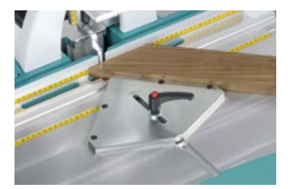
Angle fence/ Right angle fence 45° (W3060000)