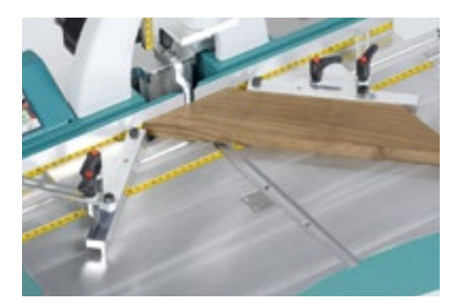
Adjustable internal fence, Set (W3012000)