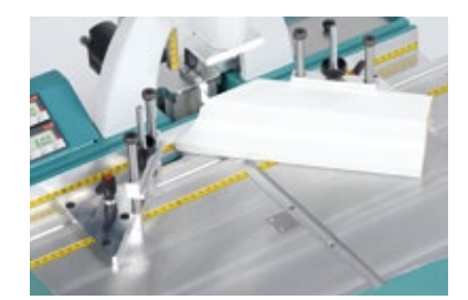
Cornice fence (W3021000)

Further accessories without illustration: