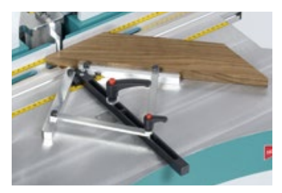
Adjustable fence "Synchro" 0-90° (W3011000)