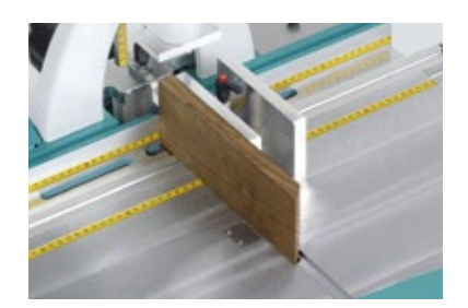
Butt stop fence elevation (W3018000)