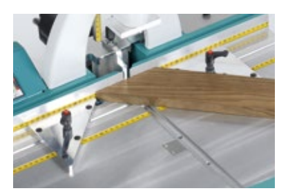
Internal fence, Set (W3010000)

Digital display for flip stops (W3014000) Flip stop for extension fence (W3022000) Multi digital gauge (W3026000) Extension fence, 1000 mm each (W3029000) Mullion fence guide (W3030000) Table extension, each 400 mm, Set (W3015000)