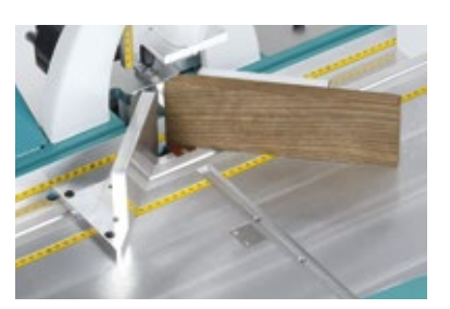
Internal fence elevation, Set (W3019000)