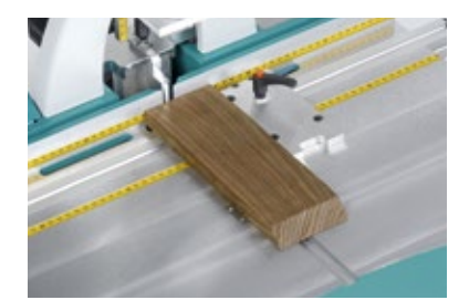
Butt stop fence (W3020000)