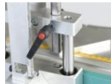
Milling depth adjustment