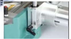
Milling height adjustment