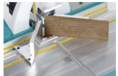
Internal fence elevation, Set (W3019000)