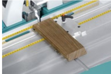
Butt stop fence (W3020000)