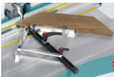
Adjustable fence „Synchro“ 0-90° (W3011000)

Further accessories without illustration: