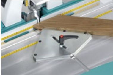
Angle fence/ Right angle fence 45° (W3060000)