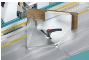
Angle fence-/Right angle fence 45° elevation (W3017000)