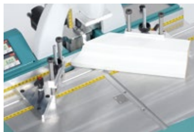
Cornice fence (W3021000)