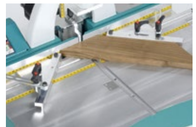
Adjustable internal fence, Set (W3012000)