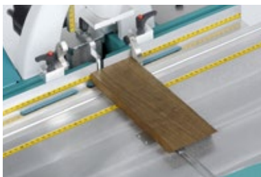
Flip stop (W3023000)