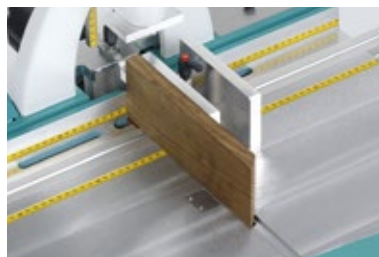
Butt stop fence elevation (W3018000)