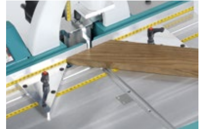
Internal fence, Set (W3010000)