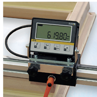
Data transfer via Bluetooth e.g. window bars