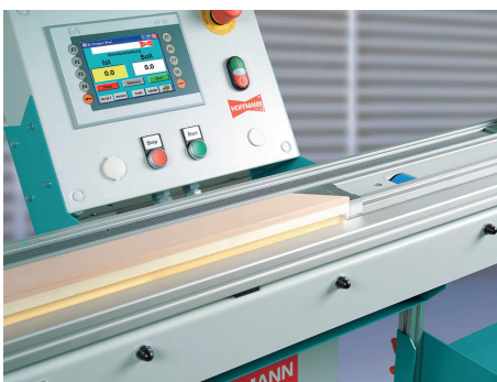
Roller conveyor with guide and fence stop